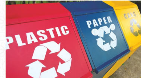
SYSTEMATIC WASTE DISPOSAL