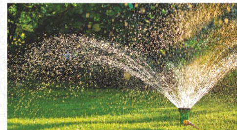
RECYCLE OF WASTE WATER