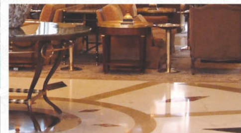
ITALIAN / IMPORTED MARBLE