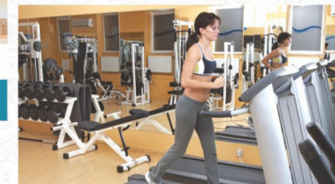
MULTIPURPOSE CLUB HOUSE