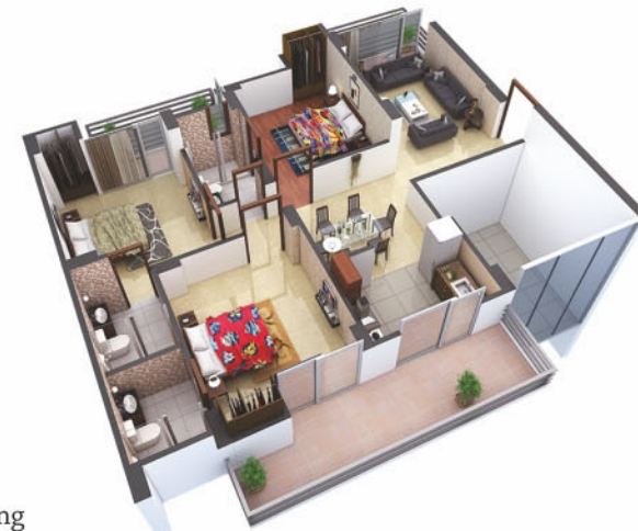
Saleable Area - 1960 sq.ft. 3 Bedrooms + 3 Toilets + Double Height Living