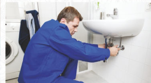
24X7 MAINTENANCE STAFF