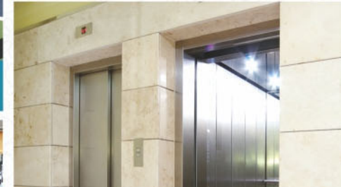
HIGH SPEED ELEVATORS