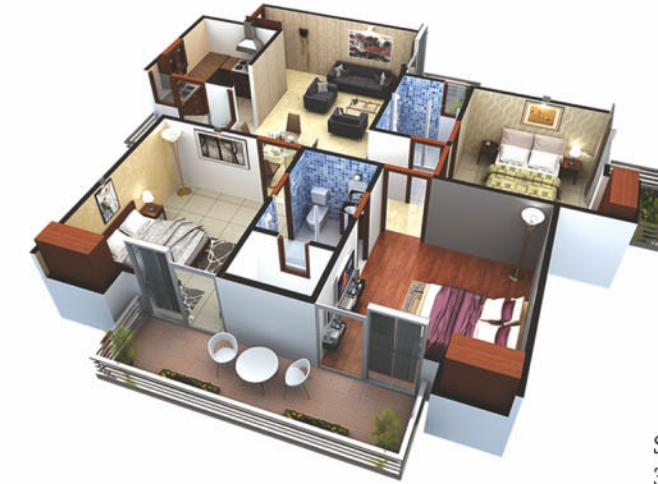
Saleable Area - 1510 sq.ft. 3 Bedrooms + 2 Toilets + Living & Dining