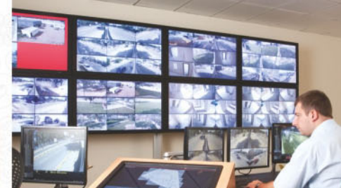
CUTTING EDGE SECURITY