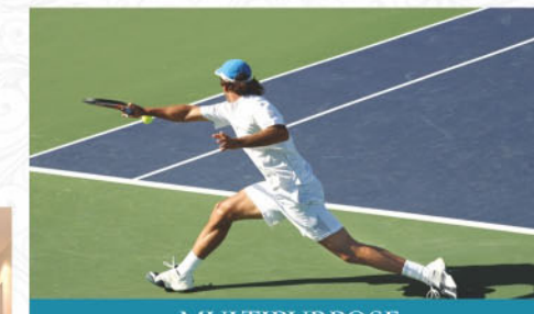
MULTIPURPOSE BASKET BALL & TENNIS COURT