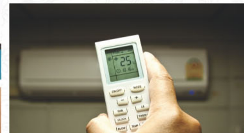
FULLY AIR CONDITIONED