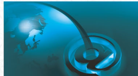
WI-FI ENABLED COMPLEX