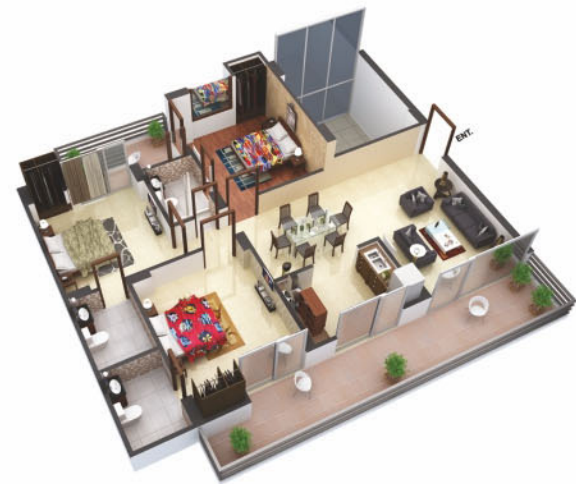
Saleable Area - 1960 sq.ft. 3 Bedrooms + 3 Toilets + Double Height Living