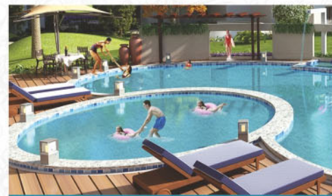
SWIMMING POOL WITH JACUZZI