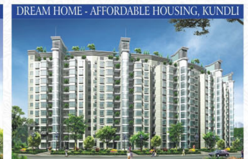
DREAM HOME - AFFORDABLE HOUSING, KUNDLI