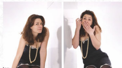
NO COMMON WALLS