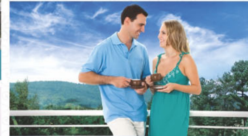
ALL APARTMENTS 3 SIDE CORNER WITH PRIVATE BALCONIES