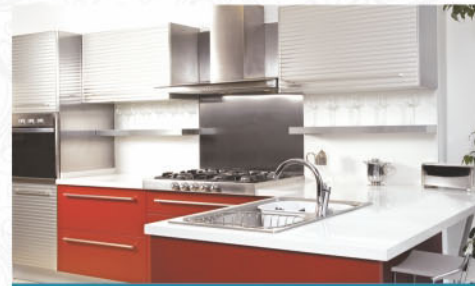
DESIGNER MODULAR KITCHEN